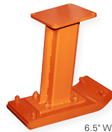
6.5" W X = Steel and wood

WARRANTY: Rammers - 1 year parts and service. Honda GX100 engine - 3 years. Subaru ER12 engine - 3 years. Please consult engine manufacturers for warranty details and updates.