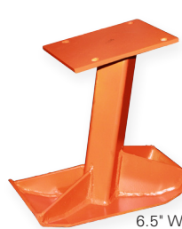
6.5" W XA = All steel